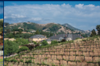
San Martin Mansion $8,999,950 24,000 SF