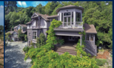
Madrone Estate Los Gatos $6,499,950 Historic