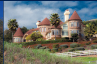
Butch Mansion Gilroy $2,999,950